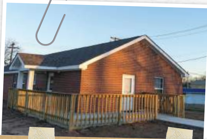
The Hope House - Located at 111 N. Fisher Street | Jonesboro, AR 72401