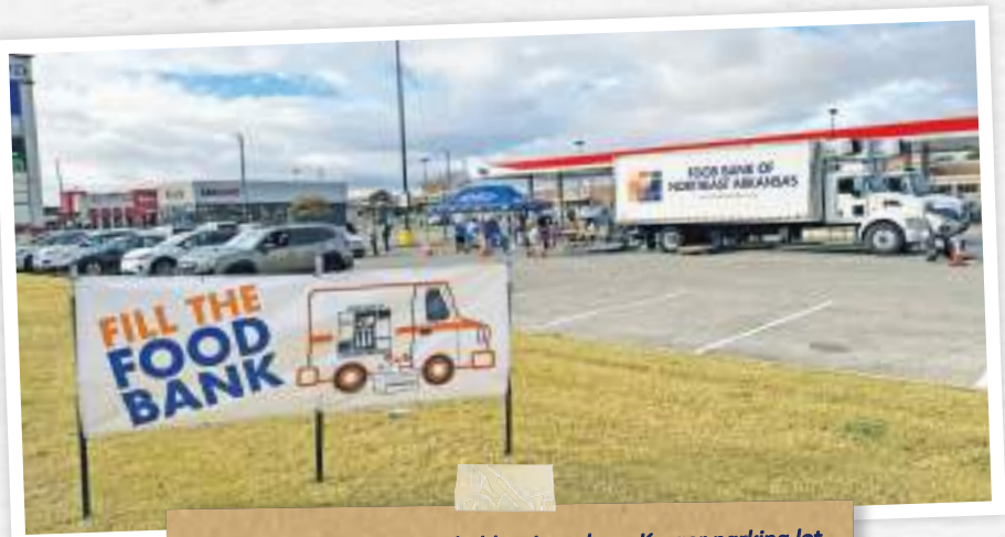
Fill the Food Bank event held at Jonesboro Kroger parking lot